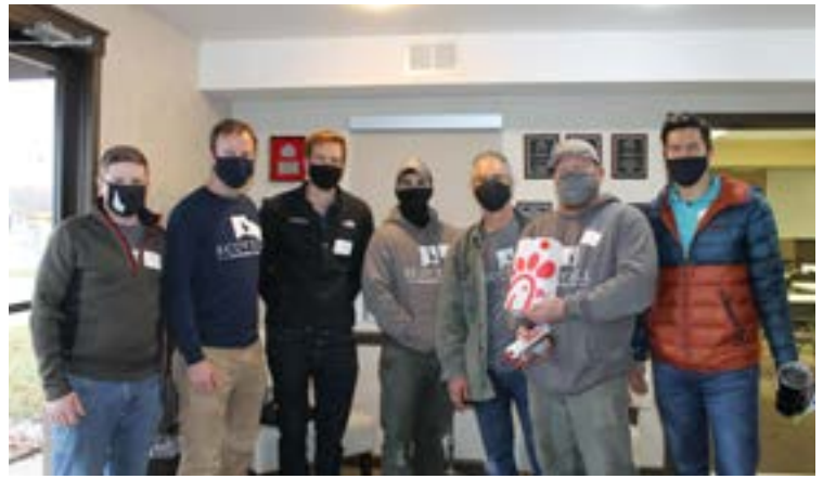
Thanks to the Scovell Remodeling team for attending the Electrical 101 seminar at the NARI office.